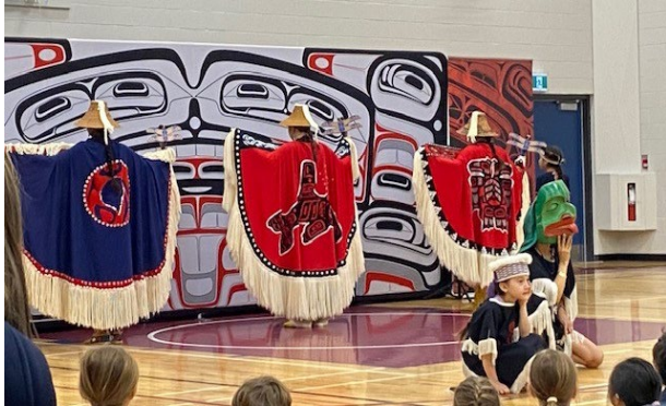
Dancers of Damelahamid, an Indigenous Dance group visited Auguston on Tuesday:

April, May and June are always months that go quickly in schools as there are more field trips and events and a whole bunch of four day weeks on the horizon. We have a lot planned for the coming months and will share as much information here as we can.