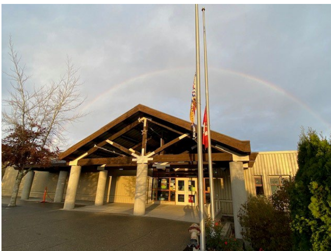
(rainbow above the school)

in the hallway by the office. Our winner will be shared with the school on Friday and in our next newsletter in January.