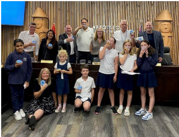
Auguston's Presentation at the Sep 24 Board Meeting

Hello Auguston families – and welcome to Fall! It's a beautiful time of year up here on the mountain and we are ready to thoroughly enjoy some crisp, sunny Fall days ahead, and also some cozy, rainy ones, too.