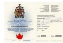
Canadian Citizenship Certificate